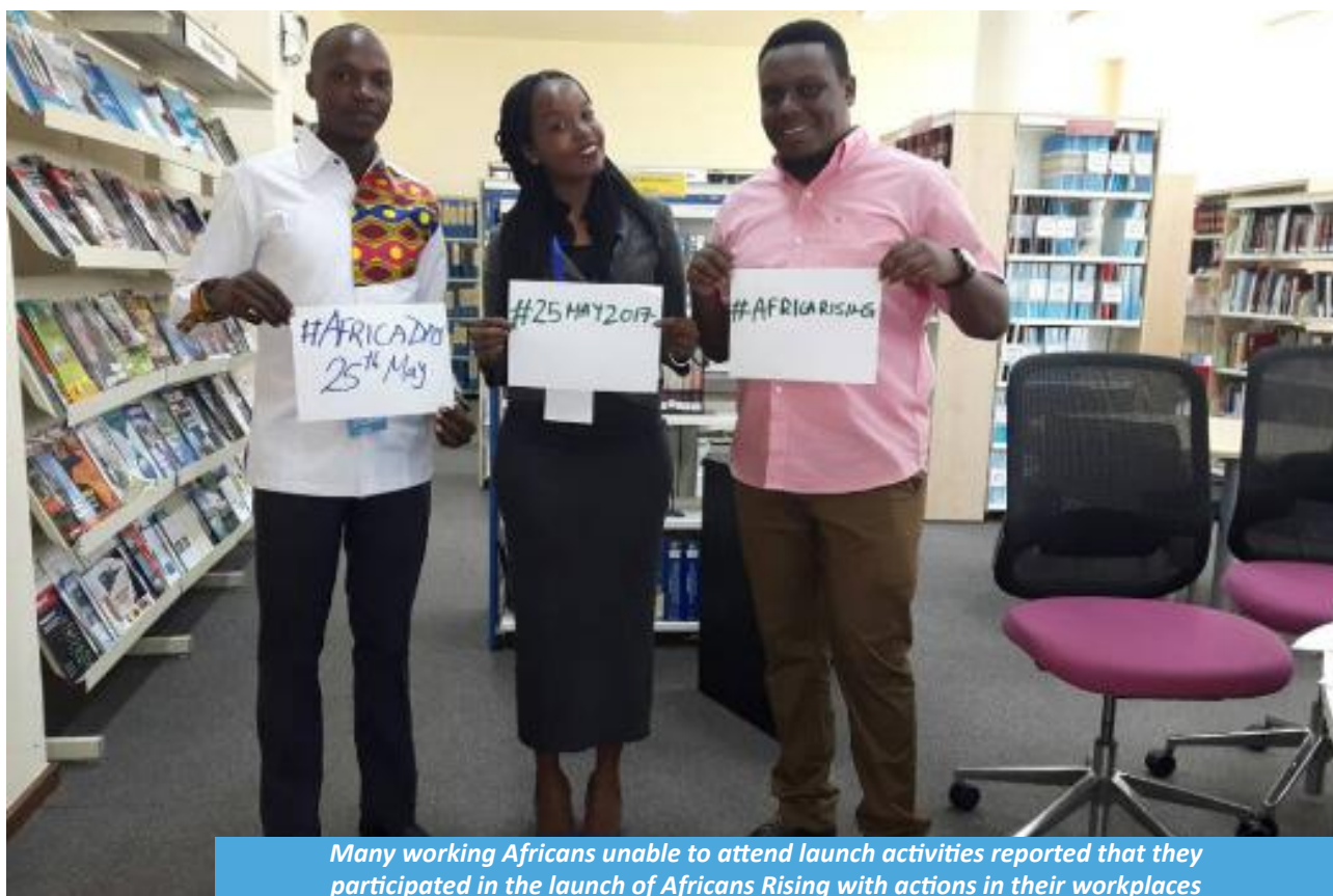
Many working Africans unable to attend launch activities reported that they participated in the launch of Africans Rising with actions in their workplaces

Actions & events connected to the launch, around the world included wearing an item of RED clothing and turning of their lights between 7 and 8pm and, lighting a candle in solidarity with millions of Africans across the continent who still live in energy poverty.