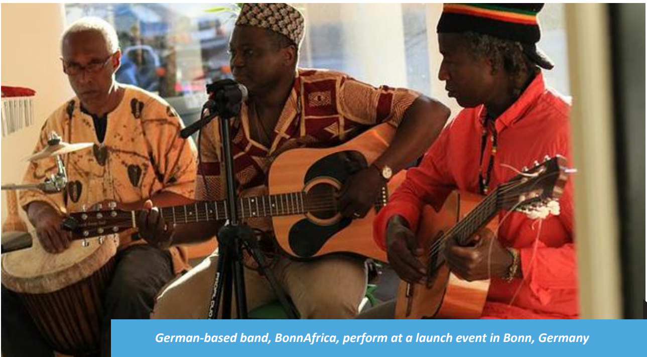
German-based band, BonnAfrica, perform at a launch event in Bonn, Germany