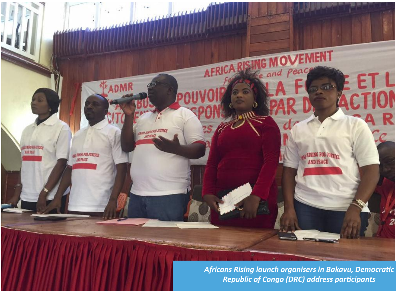
Africans Rising launch organisers in Bakavu, Democratic Republic of Congo (DRC) address participants

Red was chosen as the unifying symbolic colour that unites the various peaceful mobilisations across the continent because: