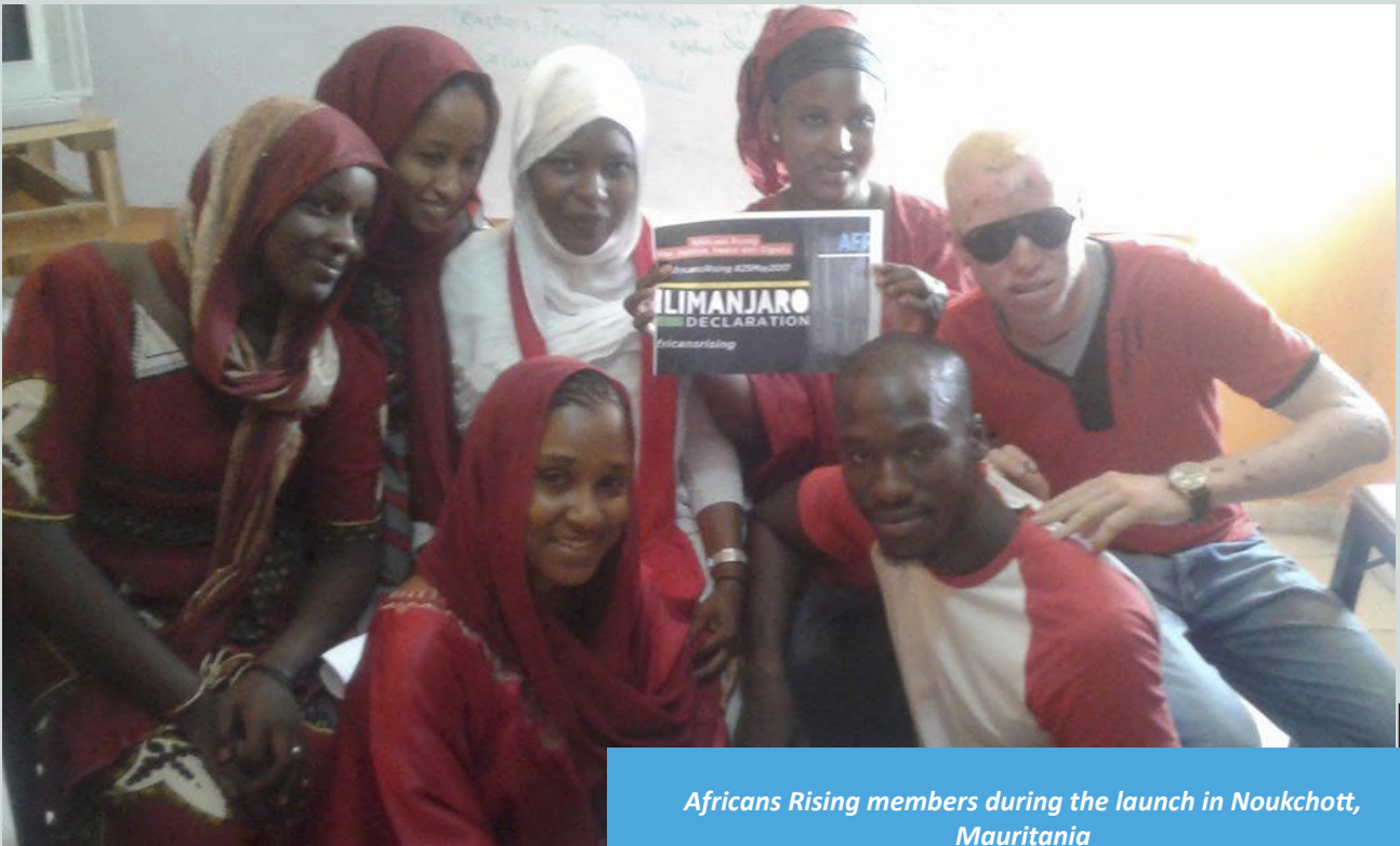
Africans Rising members during the launch in Noukchott, Mauritania