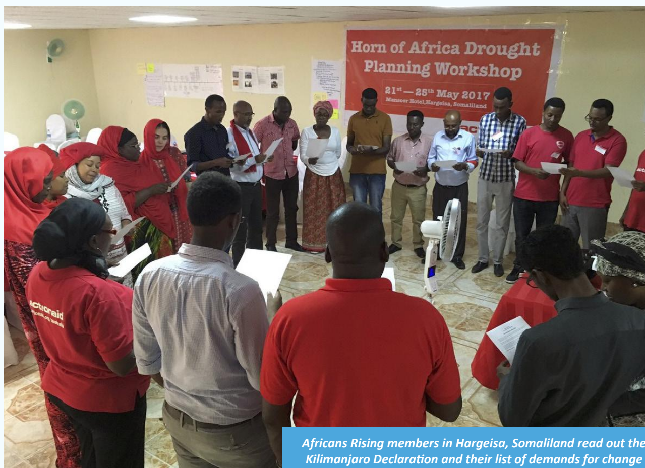
Africans Rising members in Hargeisa, Somaliland read out the Kilimanjaro Declaration and their list of demands for change