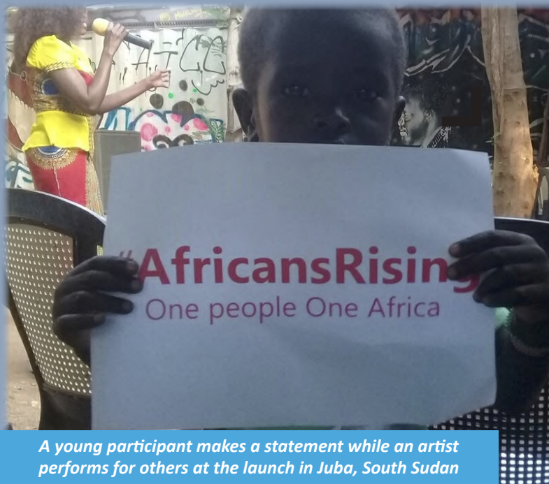
A young participant makes a statement while an artist performs for others at the launch in Juba, South Sudan