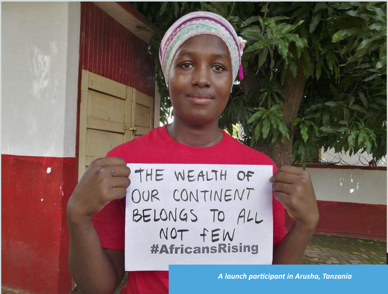
A launch participant in Arusha, Tanzania