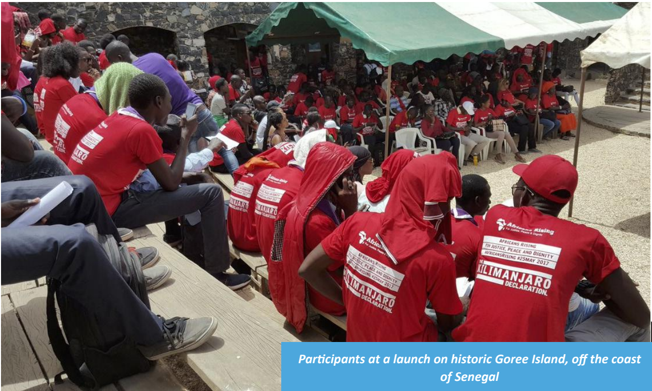
Participants at a launch on historic Goree Island, off the coast of Senegal