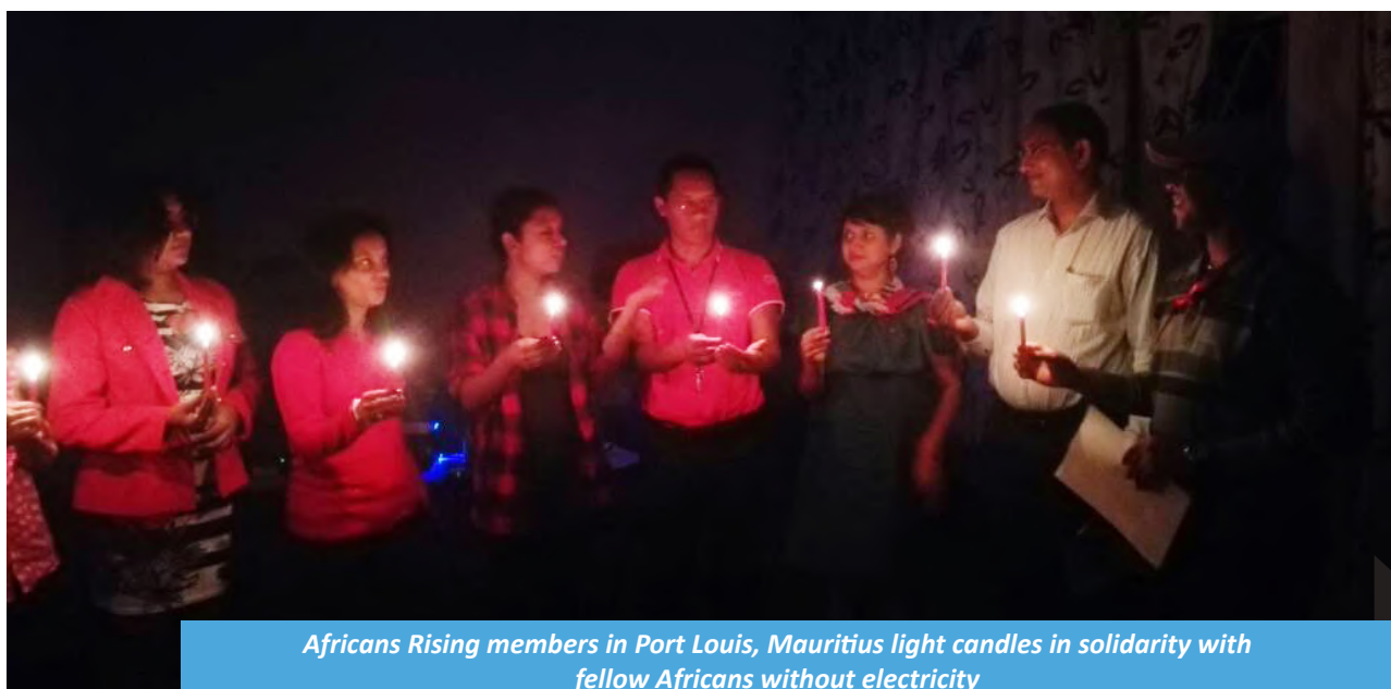
Africans Rising members in Port Louis, Mauritius light candles in solidarity with fellow Africans without electricity