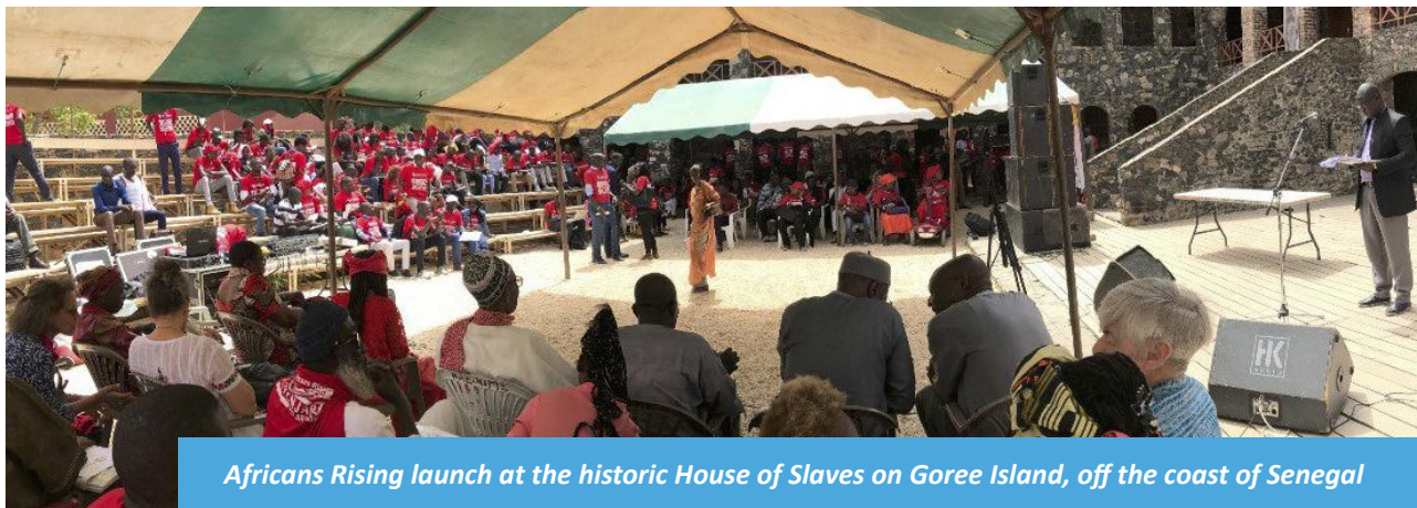
Africans Rising launch at the historic House of Slaves on Goree Island, off the coast of Senegal

African citizens and descendants living outside the continent participated in a launch on Goree Island in Senegal, a renowned historic site linked to the Transatlantic Slave Trade.