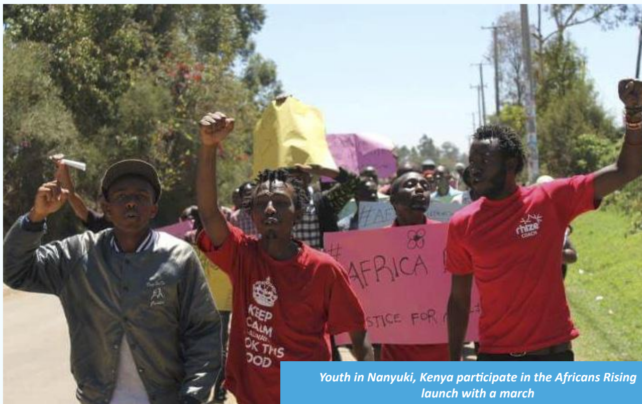
Youth in Nanyuki, Kenya participate in the Africans Rising launch with a march