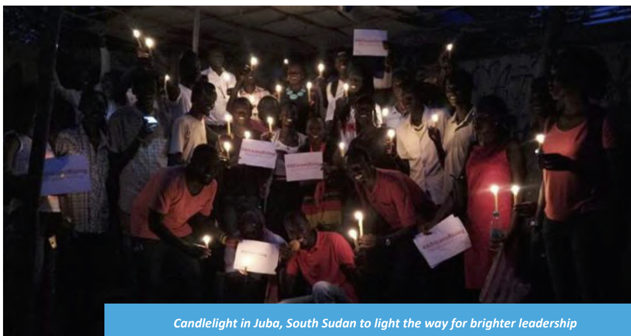
Candlelight in Juba, South Sudan to light the way for brighter leadership