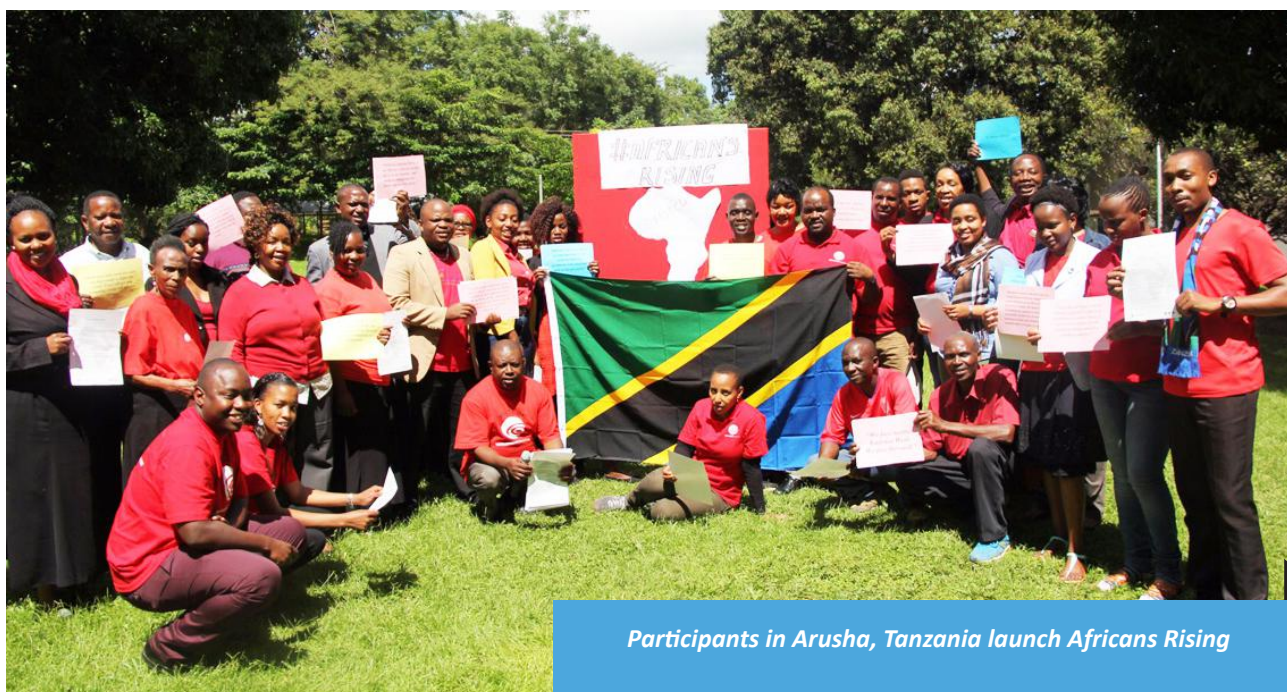
Participants in Arusha, Tanzania launch Africans Rising