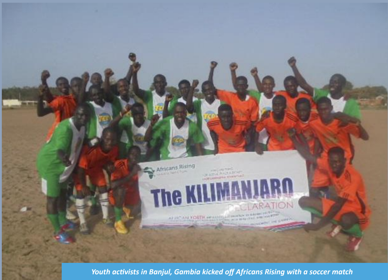
Youth activists in Banjul, Gambia kicked off Africans Rising with a soccer match