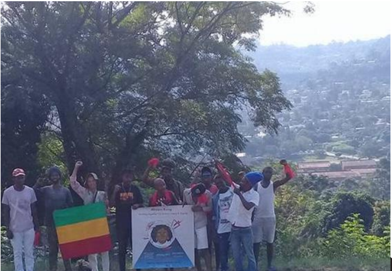
Participants who joined a hike to the top of a sacred hill to launch Africans Rising in Durban, South Africa