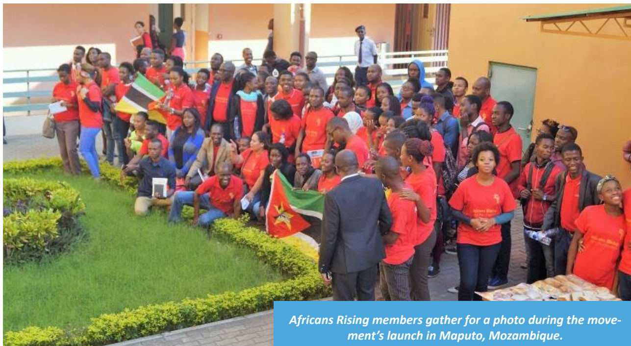
Africans Rising members gather for a photo during the movement's launch in Maputo, Mozambique.

Launch activities were centred on a number of unifying action points that all participants were asked to engage.