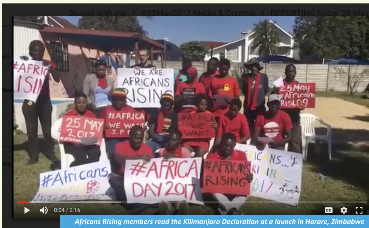
Africans Rising members read the Kilimanjaro Declaration at a launch in Harare, Zimbabwe

“ We demand good governance as we fight corruption and impunity We demand our Zimbabwean currency with value All we need is that Zimbabwe that used to be the grain basket of Africa We demand women’s rights and freedoms across society Young women demand access to land We demand efficient social services We demand climate and environmental justice We want to live happily again – we miss the 1980s and early 1990s. The list of demands launch participants in Zimbabwe read out ”