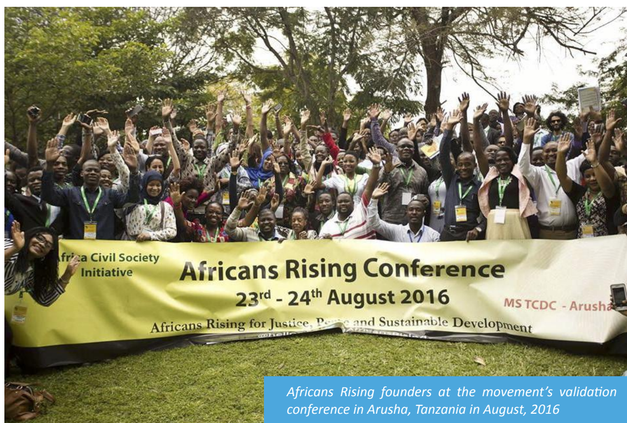
Africans Rising founders at the movement's validation conference in Arusha, Tanzania in August, 2016

One of the key aims of the launch was to ensure that #AfricansRising inspires millions of African people to demand from their governments, good governance as they all work collectively towards common goals of peace, social inclusion and shared prosperity. We aim to let our leaders know that we have had enough of this unfair and unjust system and we wanted to make clear our intention to work together, to build a new Africa.