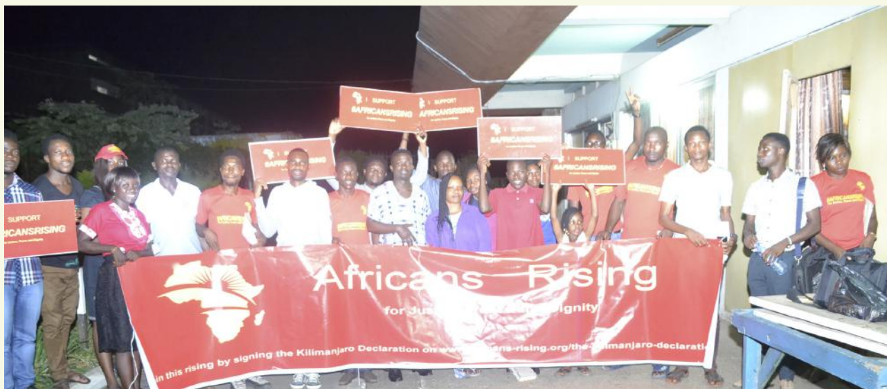
Students at the University of Ife in Ife, Nigeria launch Africans Rising